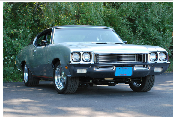
2010 Best of Show Winner 1972 Buick Grand Sport