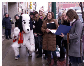
Christmas On The Avenue 2010 Snoopy and the Miltown Treblemakers Entertain our visitors!

Want to participate by handing out treats to approximately 500 children and their families? Give us a call and we will put you on the list to receive a window pumpkin! For more details, call 414-774-2676.