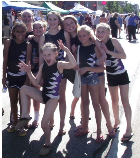
The girls from Wildcard Gymnastics pose for a picture at the 4th Annual West Allis Ala Carte