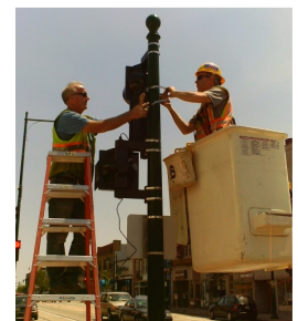
City of West Allis Workers installing the new speakers for the Downtown West Allis sound system.