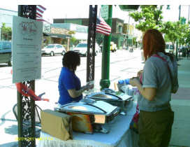
Lunch On The Avenue got a slow start. The weather did not cooperate in helping to continue the event.

If you would like to be part of this inexpensive way to spread the word about your business, call our office at 414-774-2676.