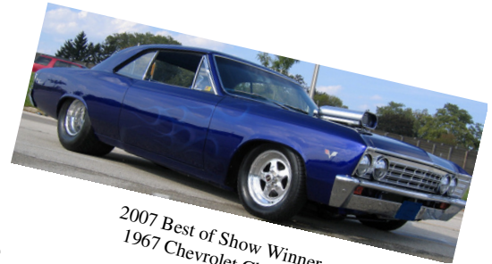
2007 Best of Show Winner 1967 Chevrolet Chevelle