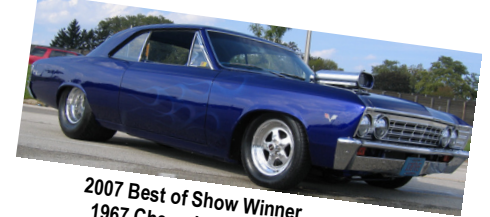
2007 Best of Show Winner 1967 Chevrolet Chevelle

Our sub-committee is already working on putting together what we hope to be another great show. Some changes for this year will include: